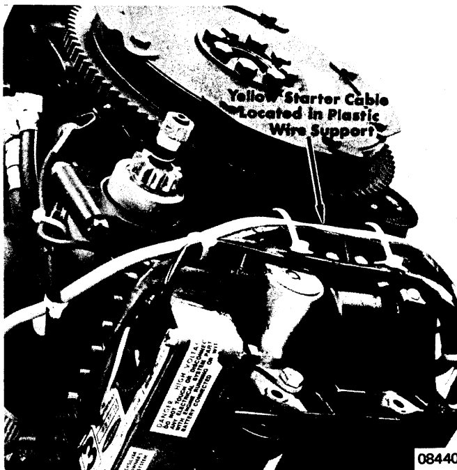
Figure 1. BEFORE Relocating Cable

A starter motor change on 1974 Merc 650 Outboards (below Serial No. 3813358) could cause the yellow starter cable to chafe on the switch box. (Figure 1) To remedy, relocate the yellow cable and sta-straps (C-61990) as shown in Figure 2. Complete this relocation on all 1974 Merc 650's below Serial No. 3813358 at a labor allowance of 0.3 hr.