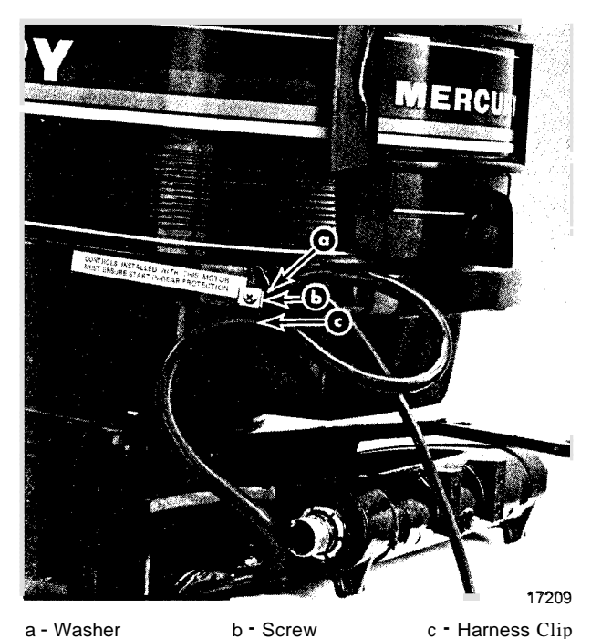
Figure 2. New Harness Routing